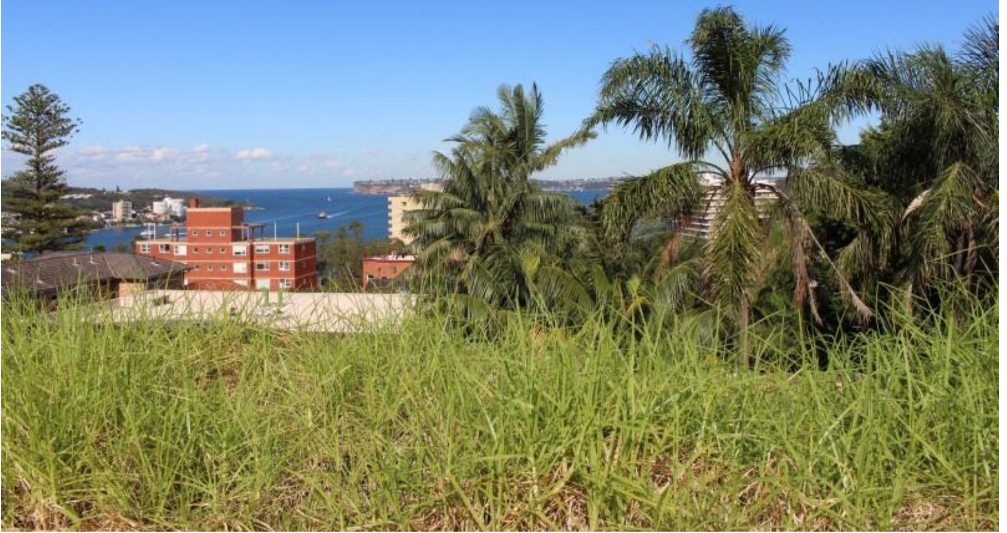
PHOTO LOCATION 2 - UNIT 4/1 BERRY AVE, FAIRLIGHT