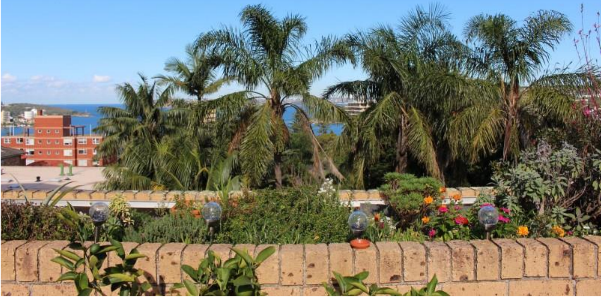
PHOTO LOCATION 1 - UNIT 3/1 BERRY AVE, FAIRLIGHT