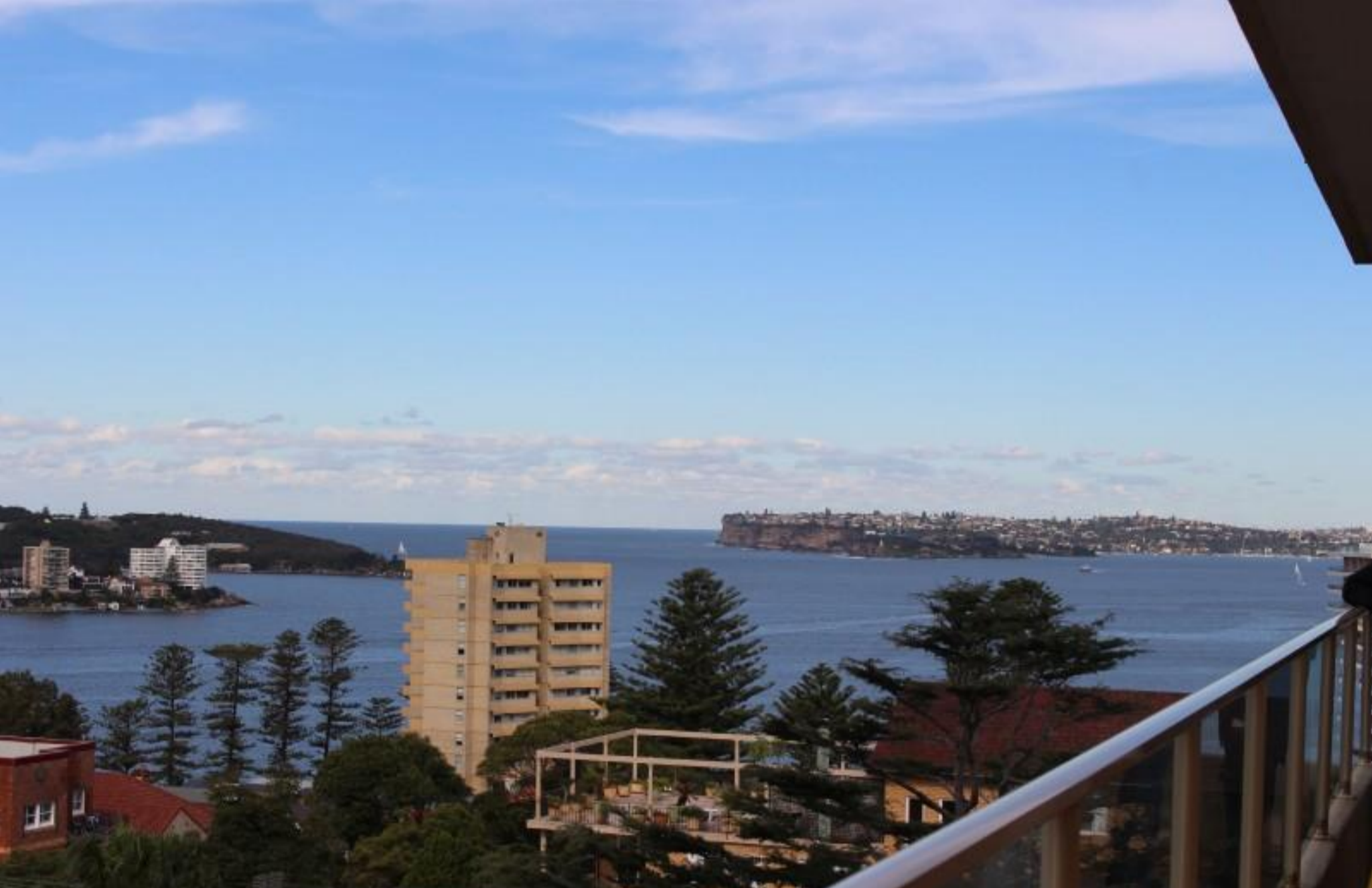
PHOTO LOCATION 6 - UNIT 3C/28 WOODS PARADE, FAIRLIGHT