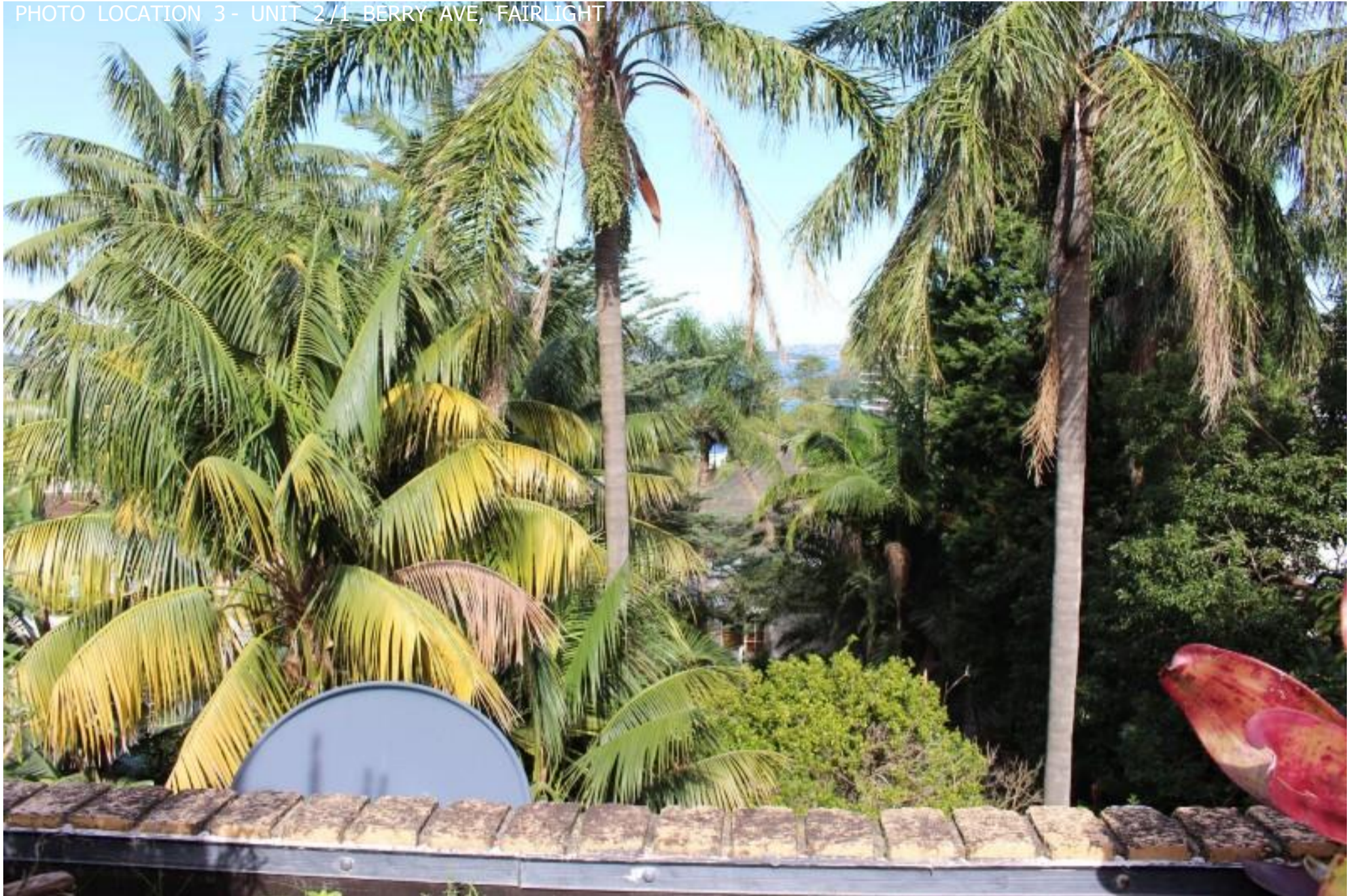
PHOTO LOCATION 3 - UNIT 2/1 BERRY AVE, FAIRLIGHT